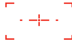
Figure 1. Laser Aimer

* Based on MIL-HDBK-217F (released December 1, 1991). The calculation is based on the part count method for the Ground Benign (GB) environmental conditions.