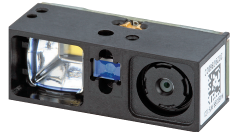
N4603 Series 2D Scan Engine

The N4603 Series is compatible with Honeywell's N660X Series and N670X Series high-performance 2D scan engines. It uses the same connector as these two scan engine families, reducing integration time and design costs while increasing design flexibility and choice.