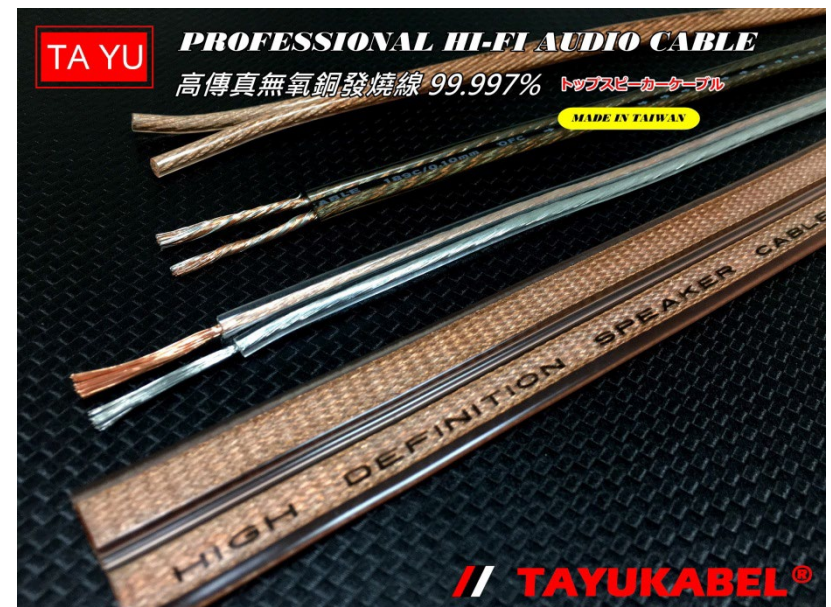
Hi-Fi Audio Cable